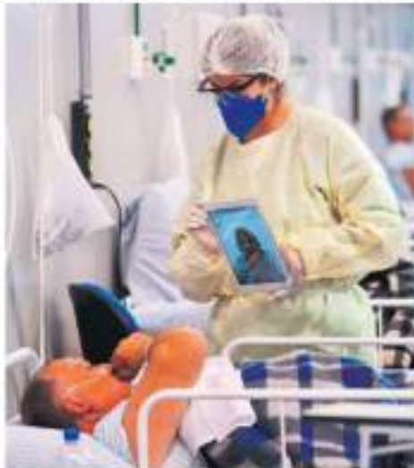
A nurse helps a patient speak to his kin via a video call in Seoul; a woman looks at a mural of a health worker with wings holding a globe on International Nurses Day on Tuesday.

In Russia, factory and construction works resumed on Tuesday, a day after President Vladimir Putin announced gradual easing of lockdown, reported Reuters. On Tuesday 10,899 new cases emerged, taking the total tally to 1,32,243. Russian government spokesman Dmitry Peskov has also been admitted with COVID-19, media reported. Agencies