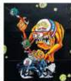
A 'Kill the Virus' mural.

"A mass vaccine or treatment may be more than a year away," said Johnson. "Indeed, in a worst-case scenario, we may never find a vaccine. So our plan must contemplate a situation where we are in this, together, for the long haul, even while doing all we can to avoid that outcome," he said. Agencies