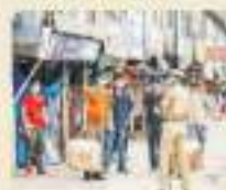
Stranded people carrying their train tickets stand outside the Delhi railway station.

application, has now made it "mandatory" to do so. However, officials said any "exception" will be decided on a "case-by-case basis", but did not rule out disallowing passengers who do not have the app installed on their mobile phones. While the guidelines issued by the railways for the 15-pair of special trains running between Delhi and major cities of the country did not say installing the mobile app was mandatory, a late night (12-24 am) tweet by the railway ministry made it compulsory.