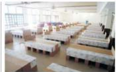
Quarantine facility at Catholic Gymkhana.

Speaking about schools, he said, "Schools should ideally remain closed till monsoon gets over, and emphasis should be given to online sessions, as the chances of children getting infected in classrooms is very high. And even if a child is asymptomatic, he/she can easily carry the virus home. Usually monsoon ailments like cold, cough and the spread to children through the common air-conditioning systems in classrooms, and there is hardly any scope of social distancing there."