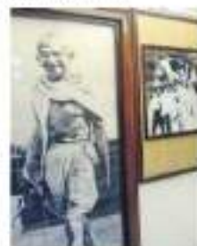
The museum houses rare photographs of Gandhi

building the virtual tour, these were people who said that since the Mahatma was opposed to technology, they were sullying his image with this modern-day endeavour.