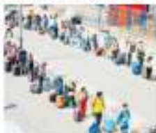
Stranded people stand in queues to enter the New Delhi railway station on Tuesday.

Having controlled Coronavirus spread to the extent possible, Karnataka wants lockdown restrictions