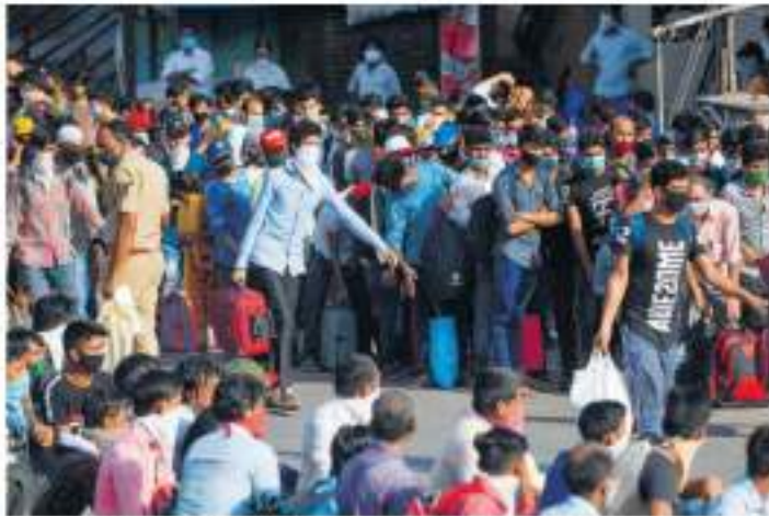
Migrant workers gather outside Dhulevi to board a bus that will take them to the railway terminus to board a special train back home, in Mumbai on Tuesday.

'Our only worry with the PM Cares fund is that it's not being spent on the victims of COVID-19. This use can be both direct and incidental. We only demand an independent audit by CAG or any other credible independent agency and daily updates. Not too much to ask from a public fund' Abhishek Manu Singhvi, Cong senior spokesperson