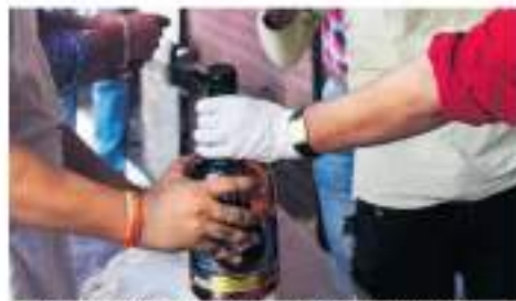
BMC had suspended liquor sales last week after social distancing norms were violated

State government allows home delivery of liquor to drinking permit holders; BMC chief clarifies order not for Mumbai