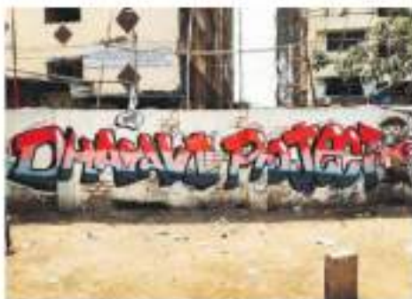
Grffiti on the wall by The Dharavi Project

Sign up for a free online graffiti workshop to embrace your creativity