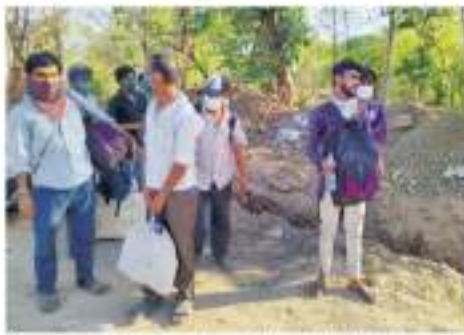
Tea sellers from Mira-Bhayandar near Manor on the Mumbai Ahmedabad highway

Migrants coming from Valsad had to forego a basic meal of chappati-sabzi and share a pack of namkeen