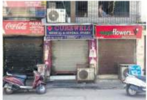
A resident said if medical stores are also sealed, people will have to go outside for medicines increasing the risk of transmission, hence these should be kept open