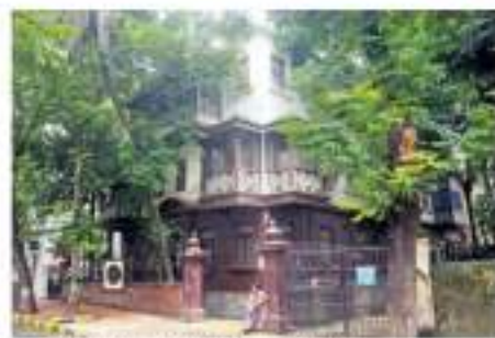
Mani Bhawan is located on a leafy road in Garden

ON May 15, 5.30 pm LOG ON TO insider.in COST ₹800