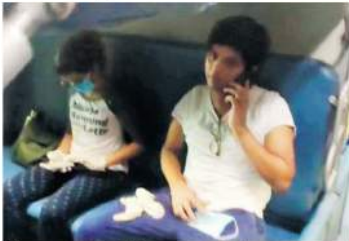
AWR spokespersons says that a total of 1,487 passengers have booked tickets for the train