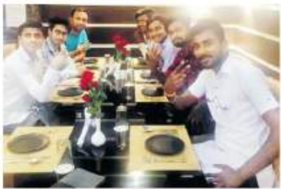
Of the seven, bright college-boys I hung out with in a town called Patna only one wished upon himself a government job; the rest wanted to do some thing of their own

In more ways than one, Bihar has been to India, what India has been to West; and that could be a good thing