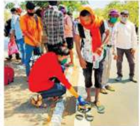
An NGO worker ensures a migrant gets footwear in his size