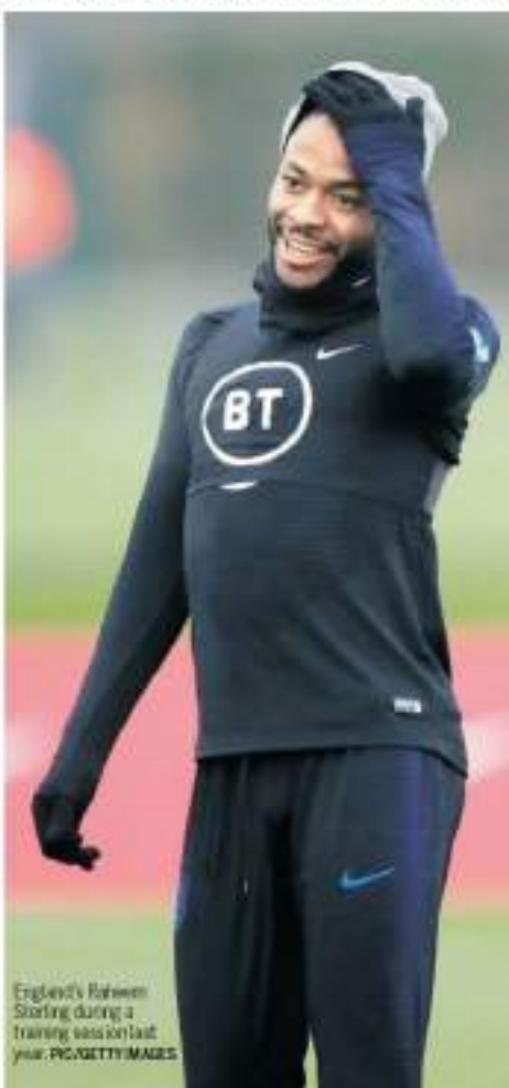
England's Raheem Sterling during a training session last year.