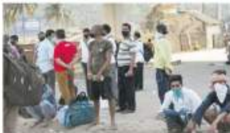
Migrants at the Mumbai Nashik highway wait for trucks that convey them to their hometowns.