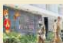
Security personnel stand outside the sealed Air India Delhi office on Tuesday. works in the commercial department. The national carrier has been crisscrossing the globe to bring stranded Indians back home.

Air India (AI) headquarters has been sealed for two days after an employee was tested positive for COVID-19. "One of the employees attending office at Airlines House has tested positive for COVID-19. As AI accords top priority to the safety and wellbeing of its employees, the building will be closed for sanitisation adhering to protocol. All support is being extended to the employee concerned," AI spokesperson said. The airline staff who tested positive