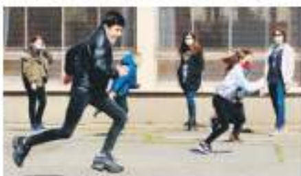
Students wearing mask play in the school yard in France. PG&WP

According to the study, published in JAMA Pediatrics, children are more likely to get very sick if they have other chronic conditions like obesity. "It is also important to note that children without