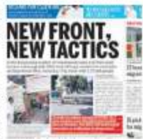
mid-day's report on the sealing of slums including Juhu Koliwada in K West ward on Tuesday

The pattern of sealing in K West ward might be replicated in the zone. "It