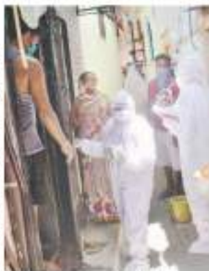
BMC health workers conduct door-to-door thermal reading and odometer check-ups at Tatyward, Kurla W.

"The COVID-19 virus is here to stay. Already a second wave has been reported from China and South Korea. In the ab-