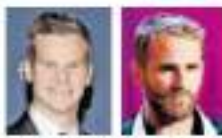
Steve Smith and Kane Williamson