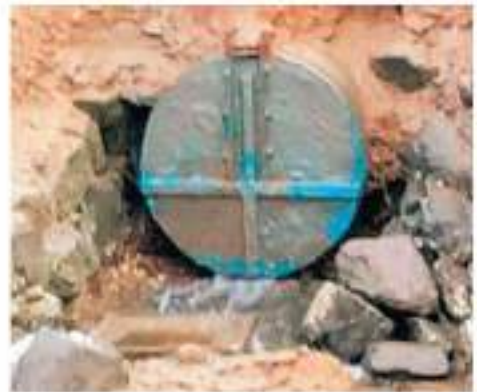
The blocked main inlet to Panje wetland