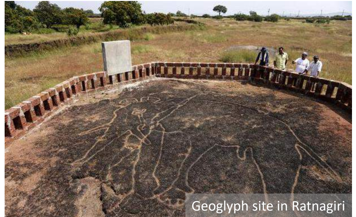
Geoglyph site in Ratnagiri