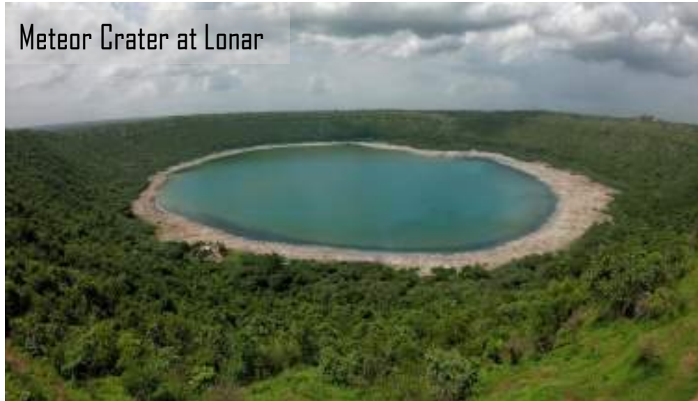
Meteor Crater at Lonar