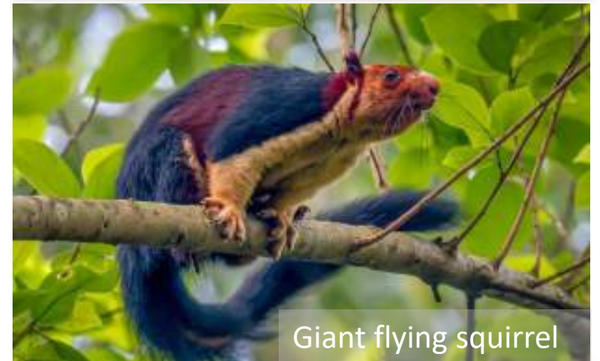
Giant flying squirrel