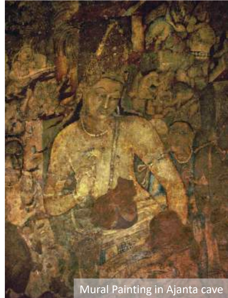
Mural Painting in Ajanta cave