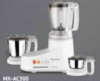
SS304 Rust Proof Stainless Steel Jar 550 Watts Powerful Motor